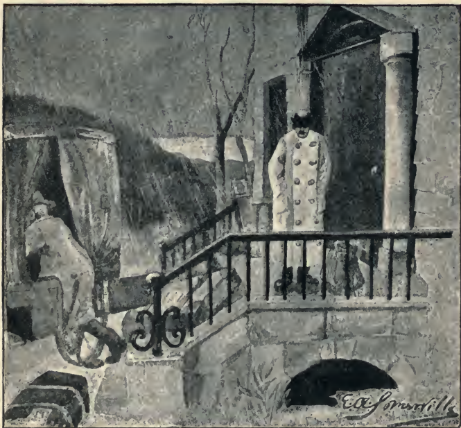
I STOOD ON THE STEPS, WAITING FOR THE DOOR TO BE OPENED

Only those who have been through a similar